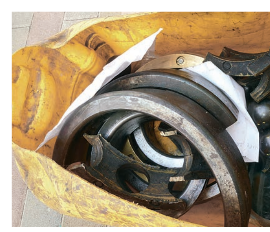
This counterfeit bearing caused major damage to a water desalination plant in the Mediterranean region

However, globalization has also made it much easier to produce and sell counterfeit goods. The counterfeiters' network covers the whole world.