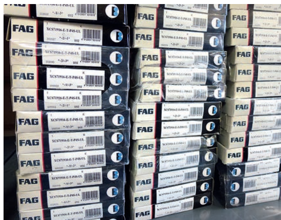
These counterfeit spindle bearings were found before they were installed

Our first case was initiated by a conscientious authorized Schaeffler distributor, who was outbid by another distributor (whom we shall refer to as "A") in a request for proposals issued by a customer from the mechanical engineering sector. Our partner said to himself, "There is no way that "A" can supply original products at such ridiculously low prices!", so he contacted the customer and offered to have the quotation for the spindle bearings supplied by "A" checked by the Schaeffler Brand Protection Team to see whether they were original.