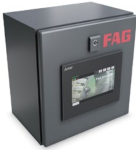
The FAG SmartQB is a stand-alone complete solution for condition monitoring