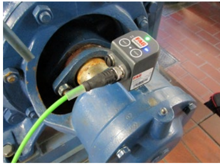
FAG SmartQB sensors monitor the condition of pumps on the machine